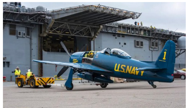
An F8F Bearcat is readied for loading in San Diego

These aircraft were in addition to the Marine Corps MV-22 Osprey tilt-rotors and MH-60 Sea Hawk helicopters embarked on the Essex as part of its normal aviation contingent. The ship, which also has other Marine elements on board, was already headed to Hawaii to take part in the upcoming multi-national Rim of the Pacific (RIMPAC) exercise, which is set to begin next week.