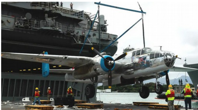
Workers offload the B-25 Mitchell in Hawaii

In addition to the P-51 and the B-25, the full contingent of private-owned warbirds also included two Catalina flying boats, an F8F Bearcat fighter, an FM-2 Wildcat fighter, two Texan trainers, and a Boeing-Stearman PT-17 biplane. Personnel at Naval Air Station North Island in San Diego, California had loaded the aircraft onto Essex for the journey to Hawaii at the end of July.