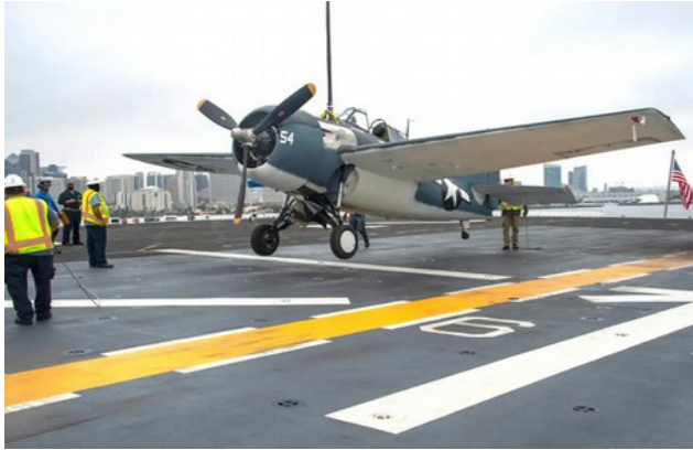
Personnel in San Diego load a FM-2 Wildcat on Essex

In some ways, Essex was reprising the role that some smaller Navy aircraft carriers fulfilled during World War II, helping to deliver combat aircraft from the United States to faraway destinations, including in the Pacific theater. Much more recently, in the late 2000s, the Wasp class Amphibious assault ship USS Bonhomme Richard – which recently suffered a devastating fire – transported "red air" aggressor jets to Hawaii for exercises.