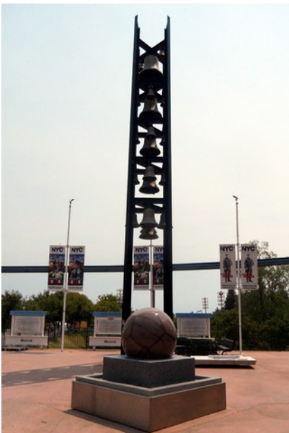
Central to the Plaza is a Granite Sphere weighing 5,180 lbs nested in a granite cradle and turning on a thin layer of water with the names of all the souls lost in the events of 9/11. A magnificent Carillon Bell Tower also graces the memorial with beautiful music.