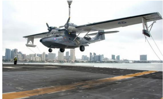
One of two Catalina flying boats are hoisted aboard

In this particular instance, Essex also carried a new C-12U Huron utility aircraft, which is a militarized Beechcraft King Air, bound for the Hawaii Army National Guard.