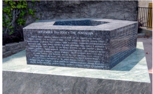
The September 11 th Memorial Plaza is comprised of several interesting elements that create an atmosphere of peace and remembrance including the Pentagon Remembrance Granite.