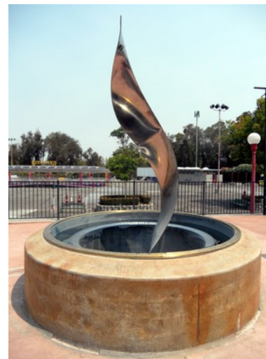
The Flight 93 Memorial with the names of the 40 courageous souls that foiled a fourth attack. The aircraft crashed in Shanksville Pennsylvania at 10:06 a.m. “LET’S ROLL!!”

This September 11 th Memorial is located at the California Exposition and State Fair grounds, 1600 Exposition Blvd, Sacramento, CA 95815, outside of building 3, just inside the main gate on the right.