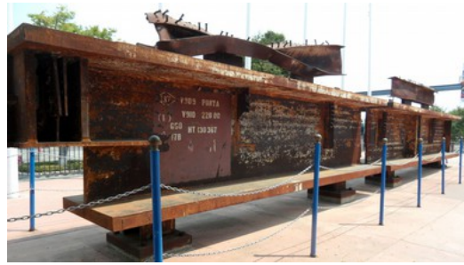
The California Exposition and State Fair (Sacramento, CA) is proud to be the final resting place for more than 125,000 lbs. of steel wreckage from the World Trade Center “Ground Zero” in New York City.

“According to the New York Times, as of April 22, 2002, 2825 people, from more than 115 countries were listed as having died in the attacks on the World Trade Center.”