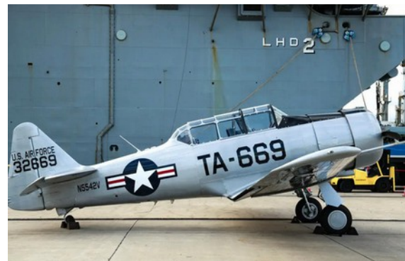
One of two Texan trainers is offloaded

Essex arrived at Hawaii's Pearl Harbor, site of the infamous Japanese attack on Dec. 7, 1941, which finally brought American fully into the War, with her unusual cargo on Aug. 10, 2020.