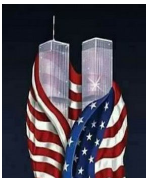
In Remembrance of those who rushed in to help.